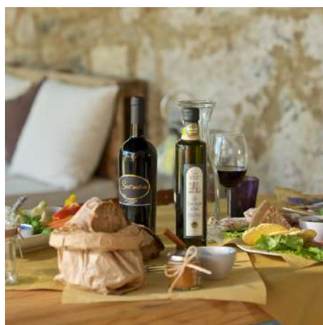
Olive Oil tastings

Visit local olive farms to experience how Tuscan olive oil is traditionally produced with tastings.