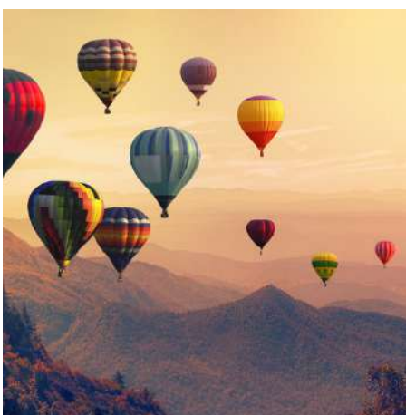
Morning Hot Air Balloon tour - Taols

Explore the stunning landscapes of Tuscany with a hot air balloon tour, paired with a Tuscan picnic.