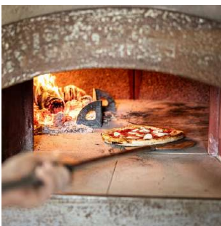
Hands-on Cooking Class

Join a hands-on cooking class to learn the secrets of regional cuisine using fresh, local ingredients.