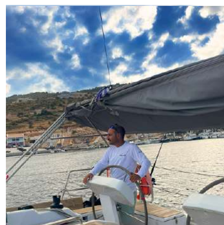
Boat tour of Elba island and Argentario

Discover the stunning Tuscan coastline on your own private charter, accompanied with knowledgeable guides.