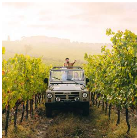
Wine Safari Experience - Valle Piccola

Explore Tuscany's renowned wineries with vineyard tours with tastings and insights into traditional wine-making.