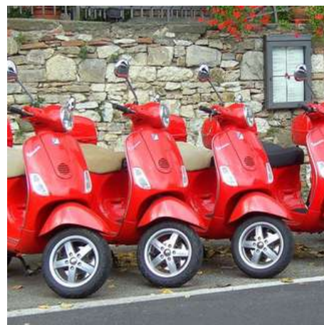
Vespa Tour - Chianti Live

Discover the rich history of Tuscany with guided tours of nearby medieval towns by Vespa.